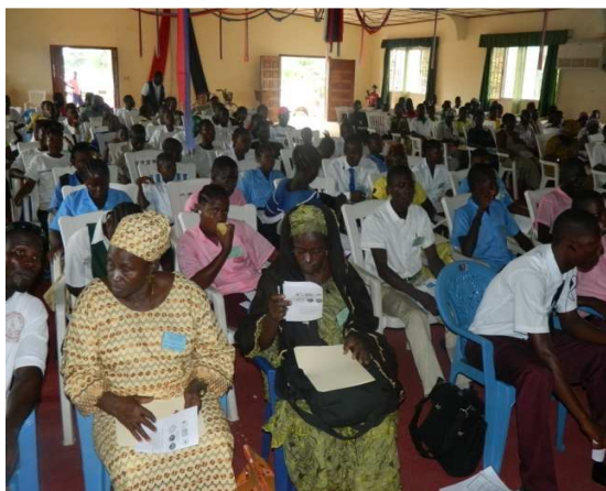
Participants @ Convention

Grass Root Convention: During the year 2011 under review, the CUPPADL in collaboration with the Association of Evangelicals of Liberia (AEL) and Concerned Christian Community (CCC) lead the holding of two days (November 15-16, 2011) Grass Root convention in the Conference Hall of Kakata City Council, Margibi County. The Grass Root Convention is unique approach to advocacy that give voice and access of slum community dwellers, leaders, community based organizations, youth and women, children and persons with disabilities to the media, political leaders and give them the space to direct WASH service provision, planning and to be heard in setting national development agenda as well demand concrete action to improve access to water, sanitation and hygiene in Liberia. The convention is a product of Bangladesh WASH campaigners which was learned by Liberia WASH campaigners following over two weeks of West Africa learning exchanged sponsored by the Water supply and sanitation Collaborative Council in November 2010. The convention mobilized the participation of over one hundred and seventy (170) people from five of the country's fifteen counties including Bong, Bomi, Margibi, Grand Bassa and Montserrado.