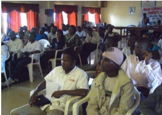
Participants National Hearing

The overall purpose of the hearings was to influence behavior and policy change, among key behavior change issues that the poverty hearing sought to influence included good hygiene practice among the population, proper management of wash facilities by local and community leaders, good practice on the storage of drinking water. Additionally, on policy issues, the poverty hearing intended to influence improvement in WASH governance and increase service delivery in Liberia through the setting up of Liberia water and sanitation commission and the national water and sanitation resource management board as approved in the integrated water resource management policy as well as increase public spending on WASH programs via national budget allocation.