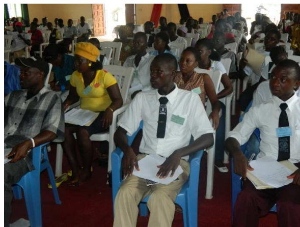
Participants @ Convention

Prior to the convention with financial support from WaterAid Liberia and Sierra Leone, the Liberia CSOs WASH Working Group held county level consultation with Grass rooters, sector players, youth and women groups at the county and district levels during which delegates of the convention were elected, venue and date for the convention derived in a participatory manner.