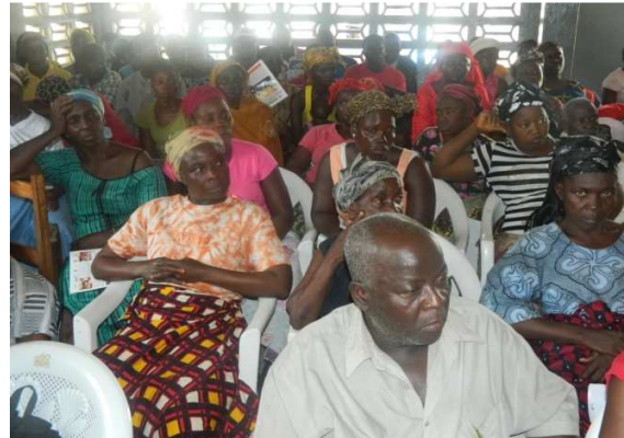
Participants Clara Town Hearing

Procedures of the Hearings: Prior to the hearings an expert researcher services was hired, questioners were developed and taken into over 75 communities by data collection agents recruited by CUPPADL in project counties including Nimba, Bong, Margibi, Grand Bassa and Montserrado. Forms were used to take statements from inhabitants mainly water, sanitation and hygiene as well as other basic social services poverty victims. Following the collection of statements from targets, selection of the worst case scenario were made and those were brought forward to the hearing to testify before policy makers, civil society, the media and development partners.