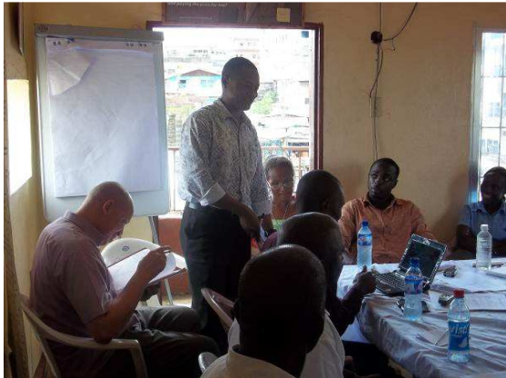
Nash-WaterAid Team leader @ meeting

reached and responsibility dedicated to relevant stakeholders. These meetings sought to help in the harmonization of programs, address the issues of duplication, and inform CSOs intervention and aid in the network drive to enhance coalition building.